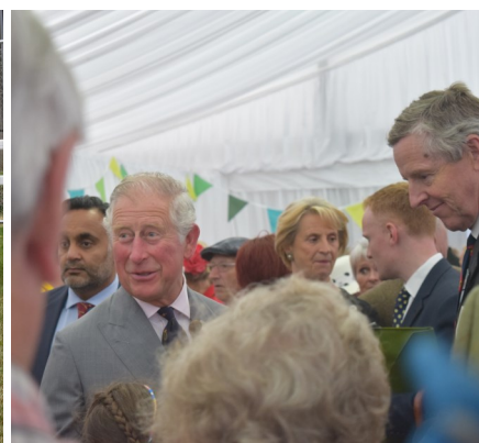
After the Parade they went back to the hospitality tent for a cream tea with Prince Charles!