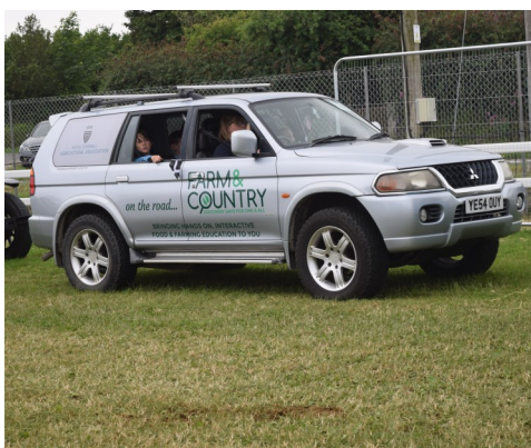
Elsie and Oscar took the weight off their feet and took part in the parade in the comfort of the Farm & Country 4 x 4