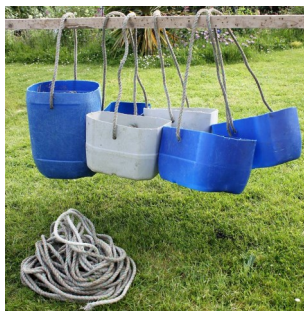
Beach clean buckets ready for use

The Beach Guardian (also known as Rob Stevenson) came into school on Monday to talk to Year 1 about plastic waste in the ocean. The Beach Guardian organises beach cleans and asks volunteers to join him in cleaning up the plastic. His aim is to use the material found to deliver educational activities to school children highlighting the impact of plastic waste on local beaches and seas.