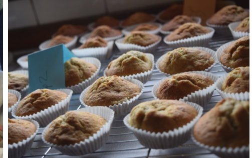
Making banana muffins