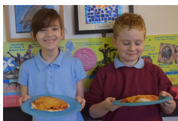
Top right: Making pizza in Y4