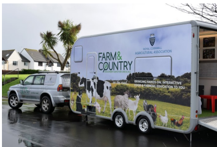
The Farm & Country trailer