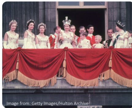
Queen Elizabeth II on her coronation.

A coronation is a ceremony where the crown is placed on the head of the new king or queen. Elizabeth II is the Queen of the United Kingdom. The coronation of Elizabeth II took place on 2nd June 1953 at Westminster Abbey, London. Many people celebrated the coronation by holding street parties.