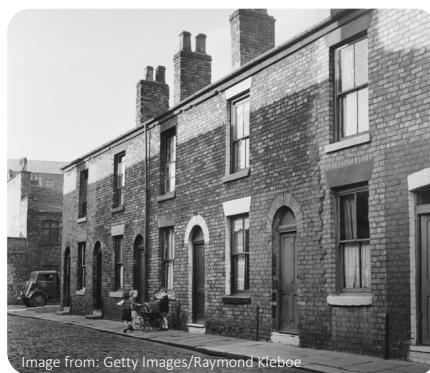
A street in the 1950s.

The way people use land changes over time. For example, in the 1950s there were fewer cars, so fewer roads were needed. Today lots of people have cars, so there are many more roads for people to drive on and driveways for parking.