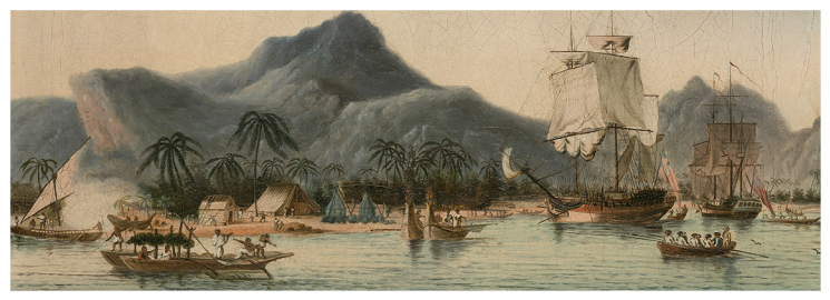
HMS Resolution and HMS Discovery

In 1776, Captain Cook went on his final voyage. He sailed on the HMS Resolution again and the HMS Discovery travelled with him. He was looking for a route between the Atlantic and Pacific Oceans. He visited the Hawaiian Islands, where he was killed.