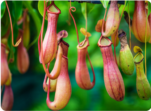
Pitcher plant, Madagascar