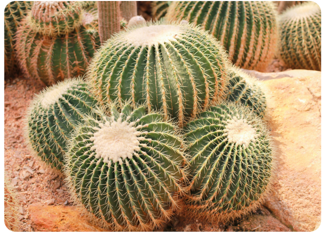
Barrel cactus, Mexico