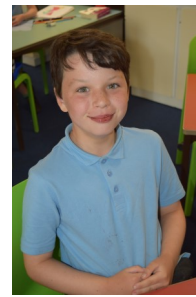
Great Skuas pod making Brigadeiro chocolates!