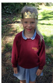
Lapwing pod wrote instructions to make a Woodland Crown, then found some lovely treasures (including eggs!) whilst gathering items to make them.