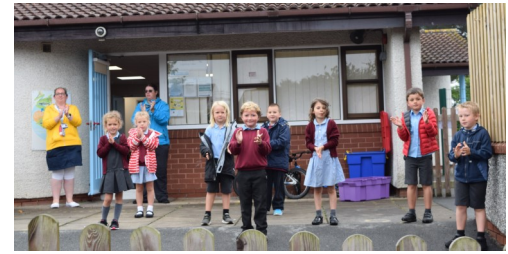
Lapwing Pod taking part in the Community Clap on Wednesday