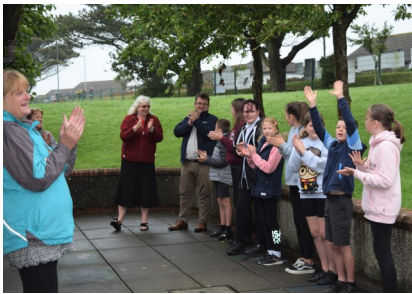
Curlew Pod B taking part in the Community Clap on Wednesday