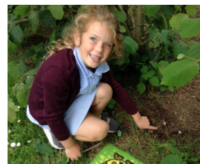
Lapwing pod learning about nests & dens